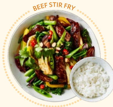
½ cup rice = 2 portions