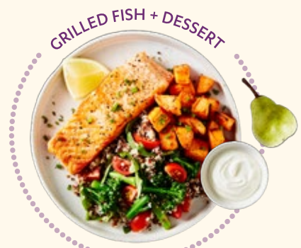
¼ medium sweet potato + ½ cup cooked quinoa + 1 piece fruit + ½ cup yogurt = 4 portions