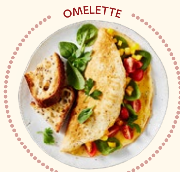
1 slice of toast = 1 portion