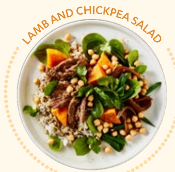
½ cup rice + ¾ cup chickpeas = 3 portions