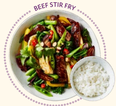
¾ cup rice = 3 portions